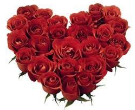
Representation of the Love that Electa displayed.